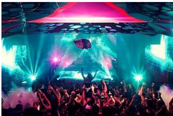
Robin 600E Spots and Beams, Robin 100 LEDBeam and ClayPacky Sharpies form part of the lighting.

When 4U Rage Festival hits KwaZulu Natal at the end of each year, an event aimed at students who have finally completed school, its party, party, party for the next two and a half weeks. If you have young children of your own, there's still time to save up and entice them to go on a family holiday to Europe instead.... now that's a mother's thinking for you! If not, it's likely they will be asking to go to Balito, where an estimated 80 000 kids visited the area in December 2013.