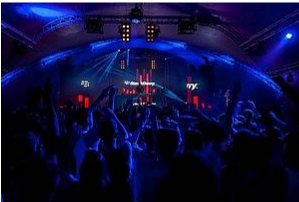
Control on an Avolites Tiger Touch

They covered the enormous double saddle tent, 18m x 80m. Two 6m Prolyte H30v Circles were used to create two double archways, spanning the venue with the use of another 60 pieces of Prolyte. The lighting looked fantastic and included Robin 600E Spots, Robin 600 Beams, Robin 100 LED Beams, ClayPaky Sharpies and Martin. Bruchhausen enjoyed the Avolites Tiger Touch for its ease of use and quick busking capabilities.