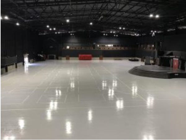
Squares marked / taped out on the venue's floor.

In August, the team took it further. They applied tape on the venue's floor to mark out blocks and walkways. A table with chairs was placed within each block. Each block would host a family. They then held five sold-out shows for Neverland Circus, a unique circus that combines the traditional Brazilian, South African and a few international circus acts, also known for reaching out to less privileged communities and charities across South Africa like orphanages, old age homes, informal settlements, hospitals and homes for people with physical and mental disabilities. At the end of each show the performers, who live by the saying, 'Anything can happen if you just believe,' spend time with the audience sharing their dreams and stories and inspiring people to dream big and believe that they can achieve anything.