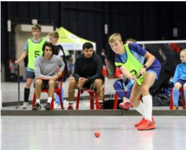
Indoor Hockey played in the

The relationship between Heartfelt Arena and AJR started in 2015 when Altus was appointed as the venue’s in-house technical supplier. The large arena has supporting venues such as a conference room, rehearsal studio, an artist holding room and VIP lounge. When a fire severely damaged the Heartfelt Arena in September 2018, it was purposefully rebuilt, and Altus was consulted to ensure the new space would be technically sound from a fibre infrastructure to creating a professional stage that can be demonstrated to clients with a touch of a button. The world-class equipment on the audio side includes L-Acoustics AARCS WiFo and X12 (for monitoring and out fills), while the lighting comprises of Robe miniPointes, Robe LEDWash 600s, Robe LEDBeam 150s, Robe LEDBeam 100s, Phoneix Bars and ETC Source Fours. The venue was also kitted out with quality sports flooring, making it ideal for sporting events as well as concerts, gala evenings and corporate occasions.