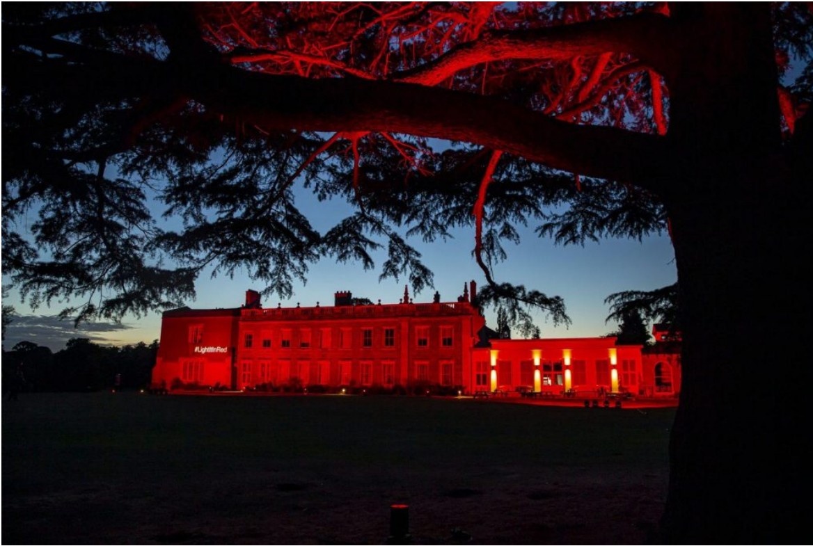
Delapre Abbey lit in red.