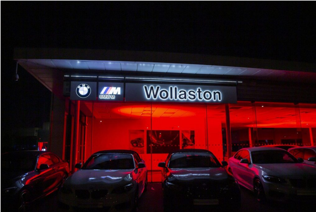
lthorp House.

Robe UK was extremely proud to work with a number of companies, organisations, venues and individuals to light ten significant buildings and landmarks in and around its hometown of Northampton ... for the #LightItInRed lighting action campaign on Monday night, 6 th of July.