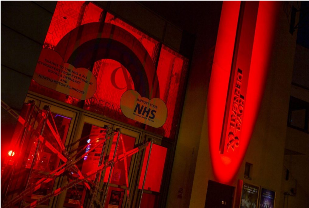
Northampton Red, Royal and Derngate.