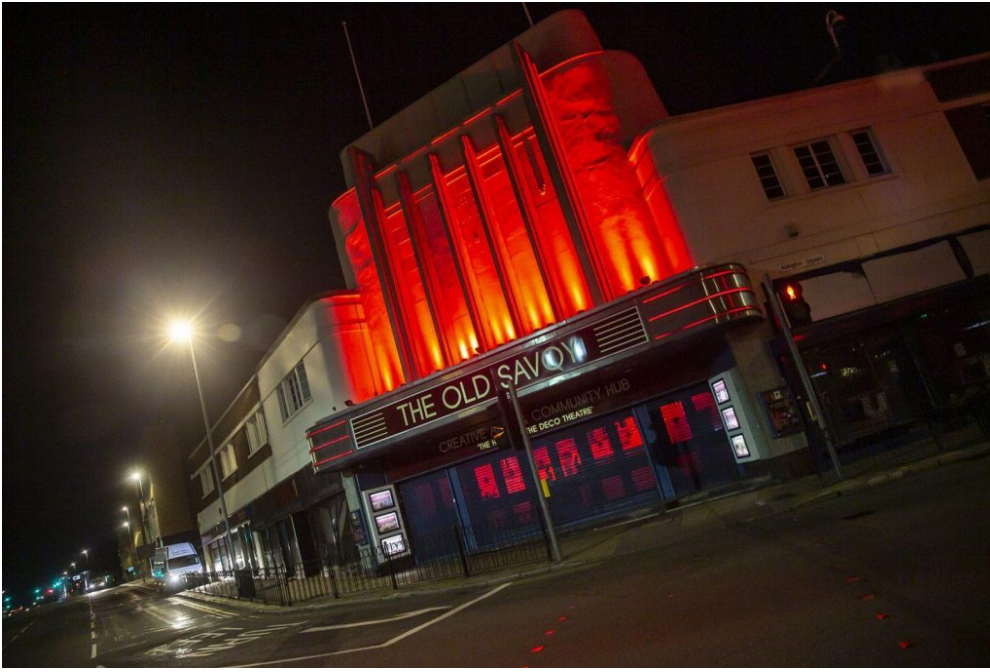
The Deco.

MLE Pyrotechnics lit the town's famous National Lift Tower, a 127.5 metre former test tower for Express Lifts which is the tallest building in the town and is now grade II heritage listed.