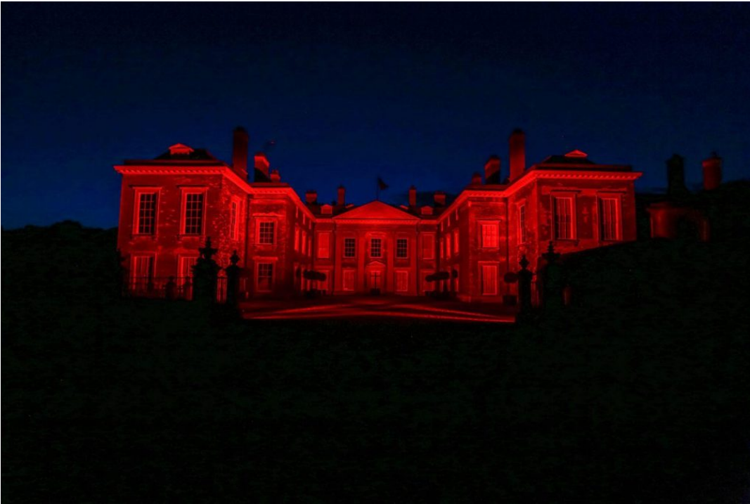
Althorp House.

Lord Spencer commented, “Althorp has held many live events, and I’m also proud to be patron of the Royal & Derngate Theatre in Northampton – so I was more than happy to show my solidarity with the live events and performance industries in the UK by allowing Althorp to be lit in red. I passionately believe in what #LightItInRed wanted to highlight.”