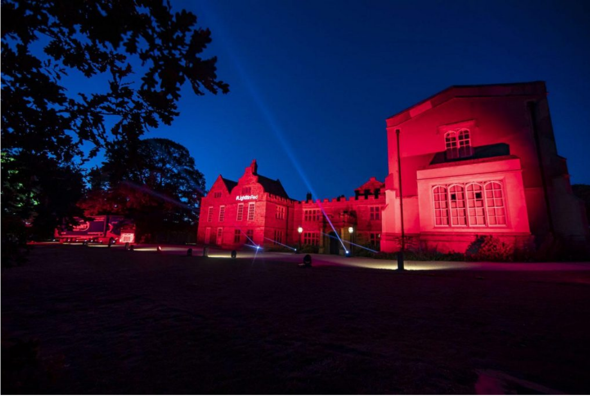
Delapre Abbey.