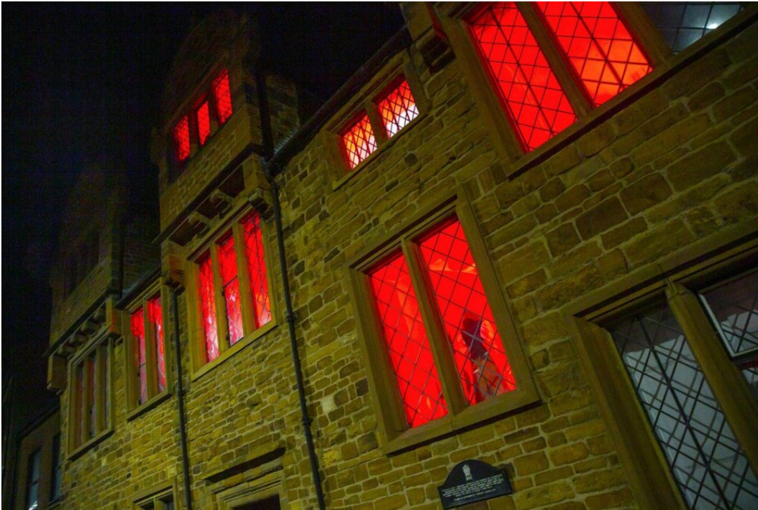
Looking Glass Theatre.