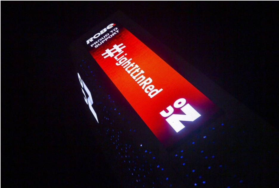
University of Northampton.

Over six hundred and fifty illuminations were on the #LightItInRed map dotted all over the UK in a highly successful show of cohesion in these anxious times.