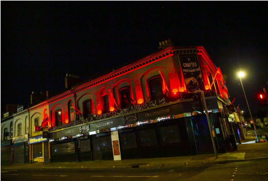
Steffans Jewellers.